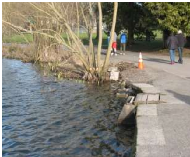
2015: Shoreline wall has toppled at the Sunnyside Outlet

In order to repair the wall an Hydraulic Permit was required. The permit process provides for the Washington Department of Fish and Wildlife to review and condition the permit with appropriate mitigation measures to compensate for loss of fish and wildlife habitat. Mitigation for the wall repairs was undertaken at a site near the Wading Pool. A portion of the shoreline was enhanced with new plantings, placement of large rocks and logs, and a fence to protect the plantings. Shoreline access for hand carried water craft was also included at the mitigation site.