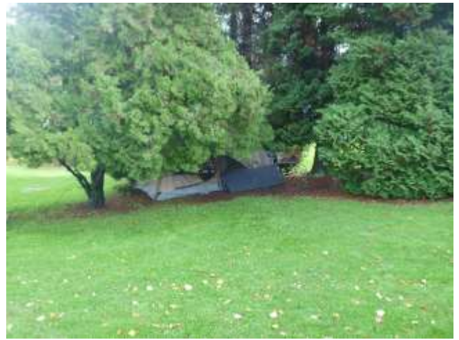
Camping near the wading pool