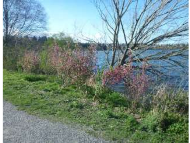
Restoration site replanted in 2010

Location: The vegetation between the Green Lake Path and Green Lake extending around the lake excepting development at East and West Beaches and at the Small Craft Center.