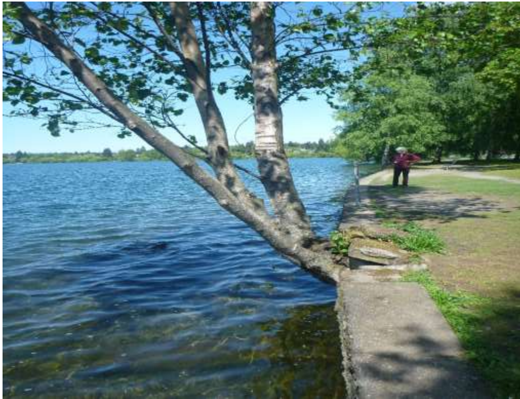
Alder tree growing between blocks of the shoreline wall on east shoreline.

Photo Location: Shoreline on east side of the Lake, opposite 65 th Street.