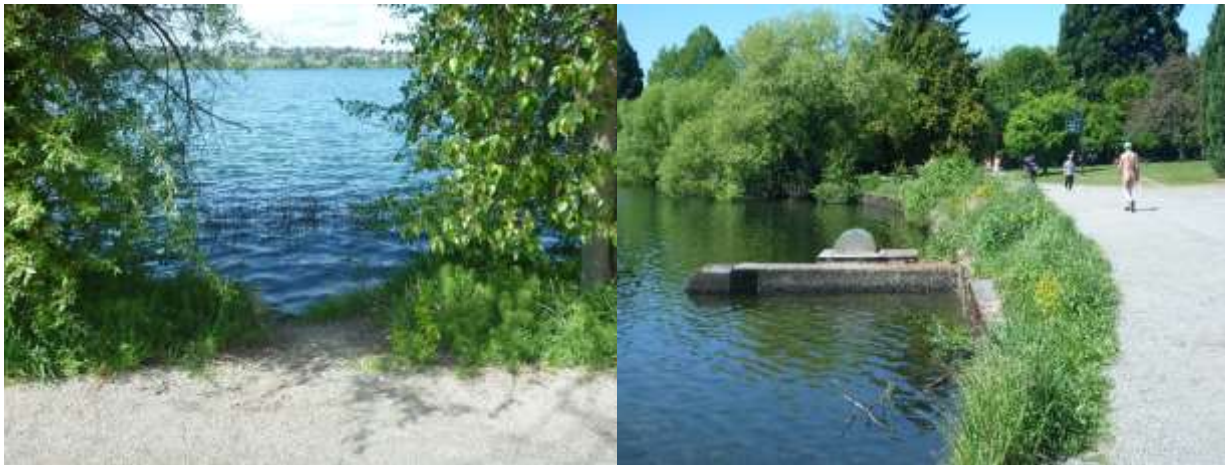
Gravel moving toward lake.

Location: The Green Lake Path was designed as an eight foot wide asphalt path with an additional four feet of gravel path on the lake side of the path. Since the trail was rebuilt in 1997, the gravel trail has been widened both by use and by subsequent addition of gravel to the trail.