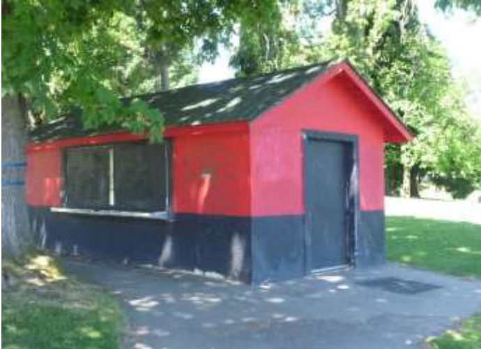
1. Food Service at West Beach