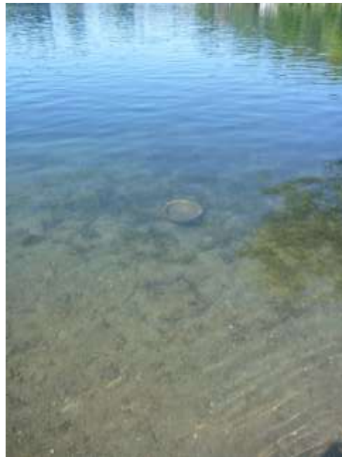
Waste Bin Lid Near Sunnyside Outlet

Location: Many locations around the shoreline of Green Lake.