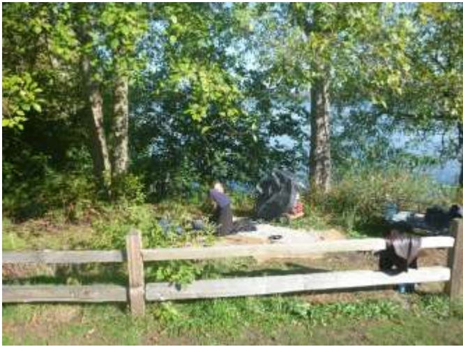
Camping in a vegetation island