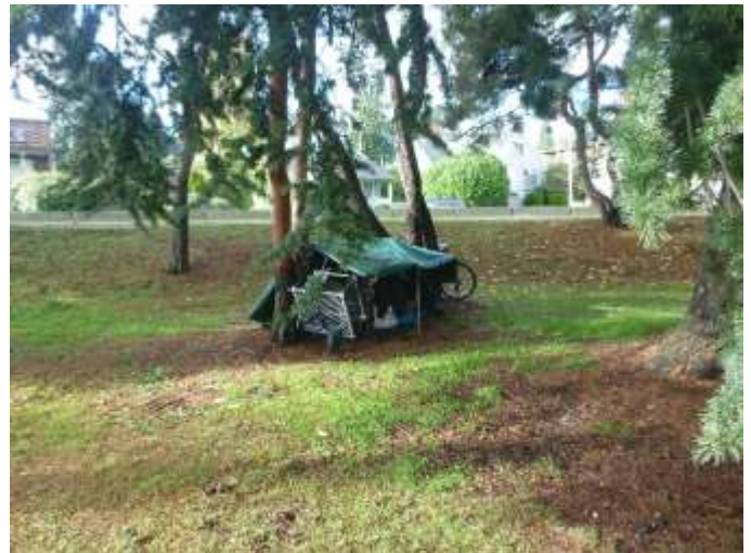
Camping next to Aurora Avenue