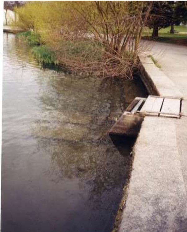
2004: Trees & Shrubs at Sunnyside Outlet