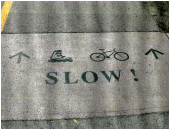
Embedded Brass Signage