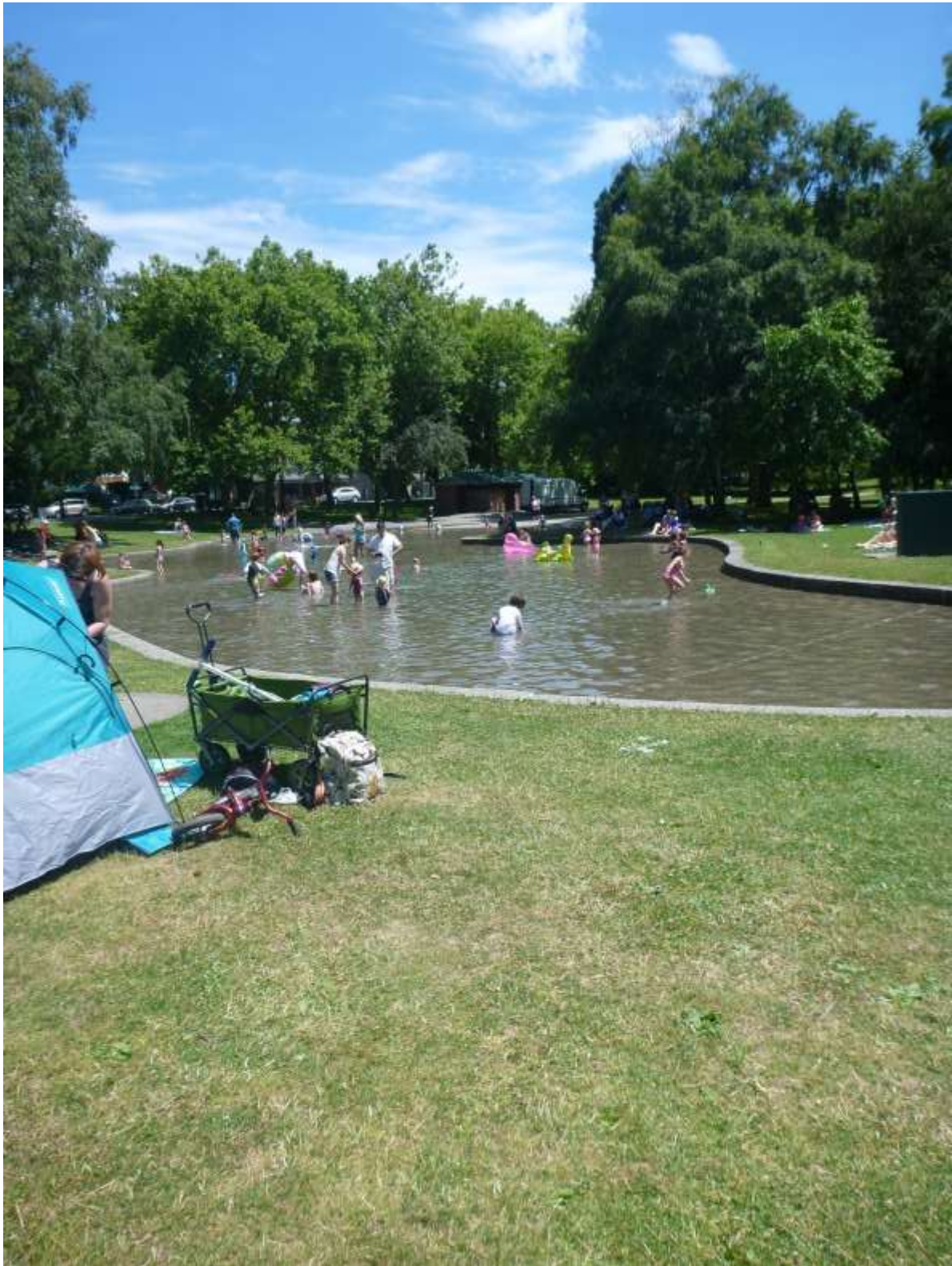
Green Lake wading pool on a sunny day in June