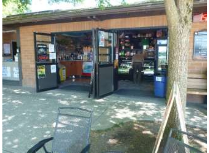
2. Food Service at East Beach