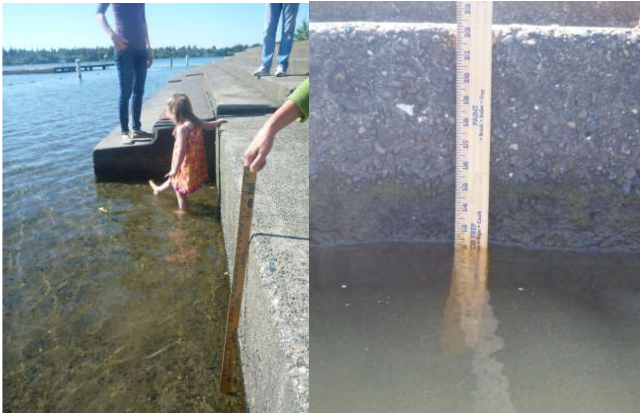
Steps into Water at West Beach. From the sandy bottom to the top of the first step is 22 inches. The top of the bulkhead in the foreground is 27 ½ inches.

Location: West Beach steps into the water.