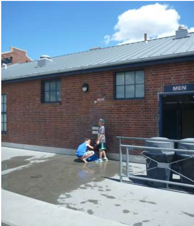
Rinse-Off Shower at Golden Gardens