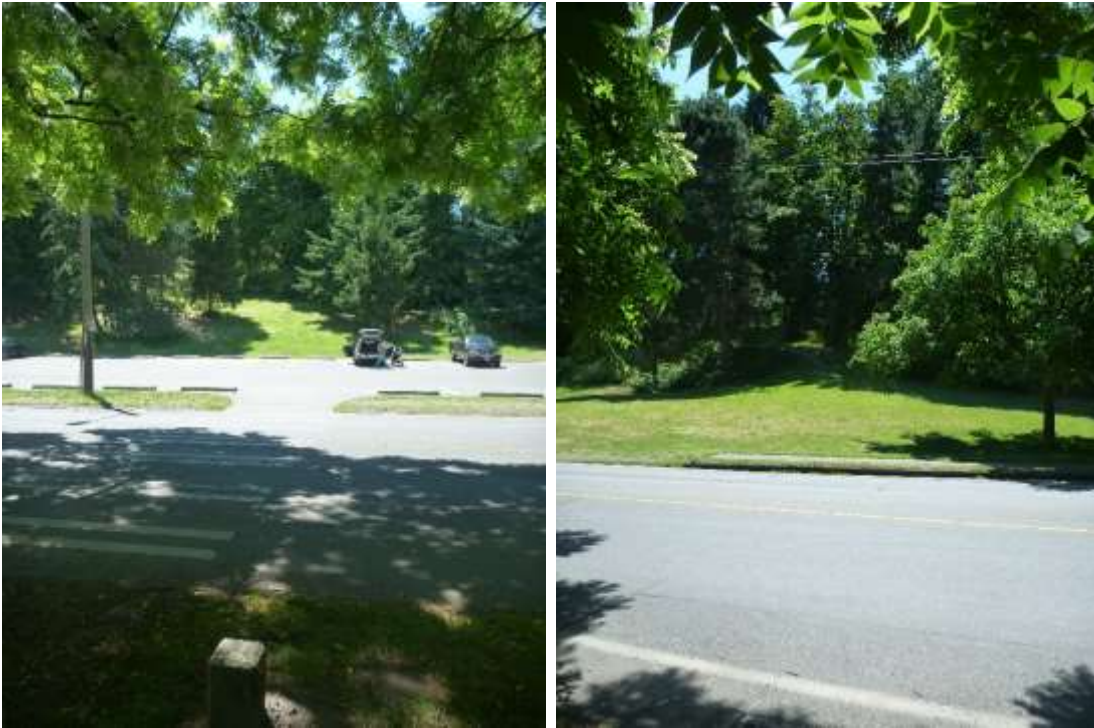
Two possible alignments linking the Green Lake Path to Upper Woodland Park

Location: West Green Lake Way N. separates southern border of Green Lake Park from upper Woodland Park.