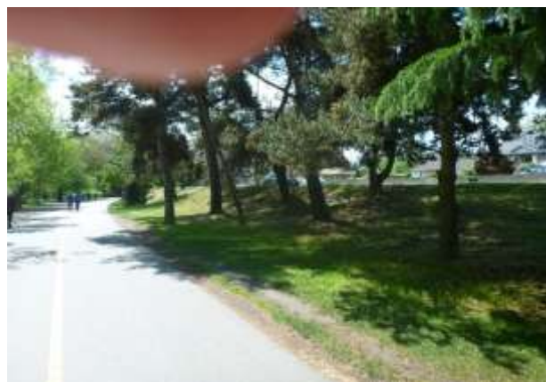
Gap in the trees bordering Aurora Ave. Trees between Aurora Ave. & Green Lake Path

Location: Green Lake Park along its western boundary with Highway 99 – Aurora Avenue N.