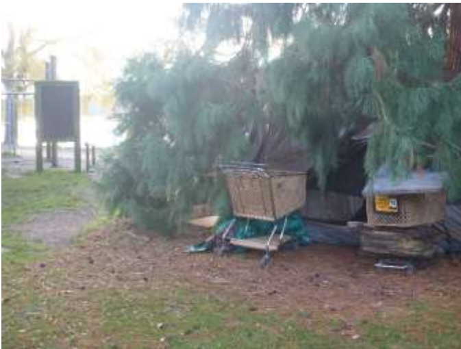
Camping near boat rental (with tapped in electricity)