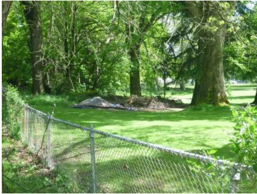
Debris piles in the Pitch and Putt Golf Course persisting over the winter.

Location: Northeastern corner of the Pitch and Putt Golf Course located at Green Lake Way N. and E. Green Lake Way N.