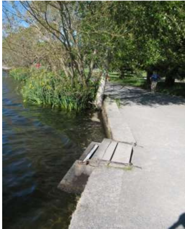
2014: Trees & Shrubs at the Sunnyside Outlet