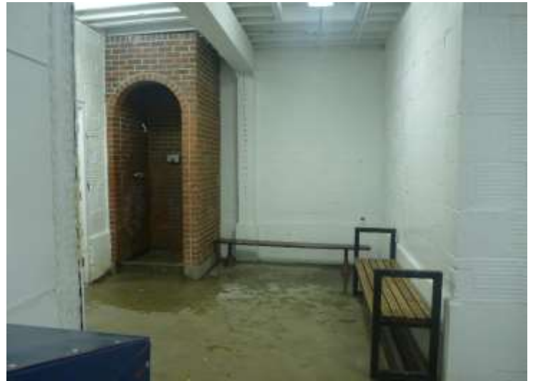
Men's Shower, West Beach (Bathhouse)

Location: The Bathhouse located at West Beach.