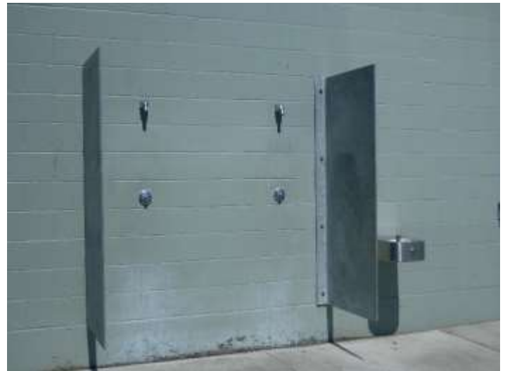
Rinse-Off Showers at Magnusen Park

Location: West and East Beaches at Green Lake.