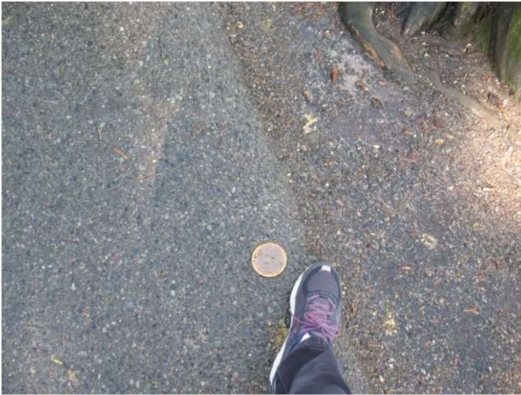
Trail Marker on the Green Lake Path