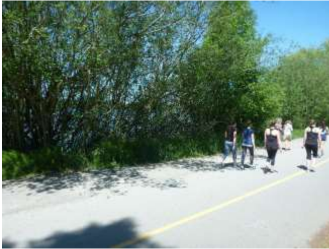
Recent growth of alder and willow